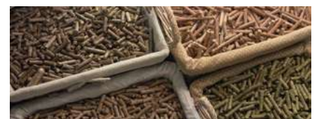
Mills & Feed