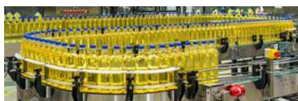
13 th Saudi Food Pack

The 30 th International Trade Show for Food Products, Ingredients & Technologies