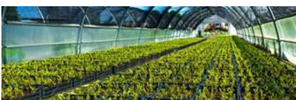
30 th Saudi Agrofood

The 30 th International Trade Show for Food Products, Ingredients & Technologies