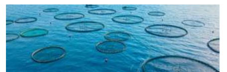
7 th Saudi Aquaculture

The 13 th International Trade Show for Food Processing and Packaging